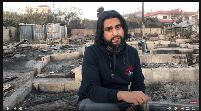
Taskforce GLM | We are on the ground LIVE at the BURNT Syrian camps! 🇸🇾